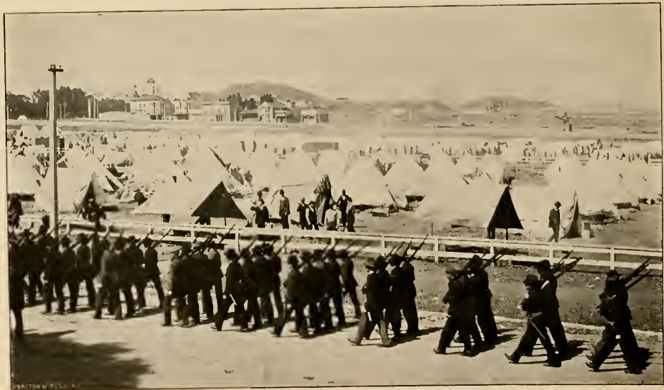
CAMP SCENE IN SAN FRANCISCO.